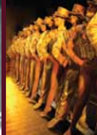
A Chorus Line