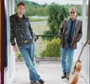
Loggins & Messina