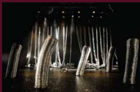
The Aluminum Show

Monday through Friday 9 am-5 pm Saturday 10 am-4 pm