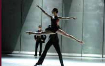
Radio and Juliet